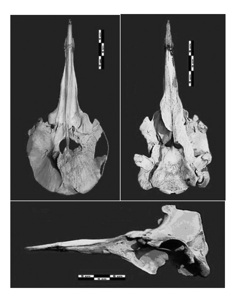
FIGURE 2. Dorsal, ventral and left lateral view of a slightly damaged skull of M. peruvianus (GPS004) found at 29°16'S,71°25'W in north-central Chile. Note the transverse fracture of the rostrum at the height of the maxillary excrescences. Scale shown is 150mm.

orderly trabeculae are visible dorsally than ventrally. It is hypothesized that upward pressure on the rostrum during feeding, or a potential buccal infection, may explain less efficient osseous remodelation and healing at the buccal side. Overall, primary bone formation was insufficient to hold the fractured rostrum tip attached after the skull was prepared for archiving.