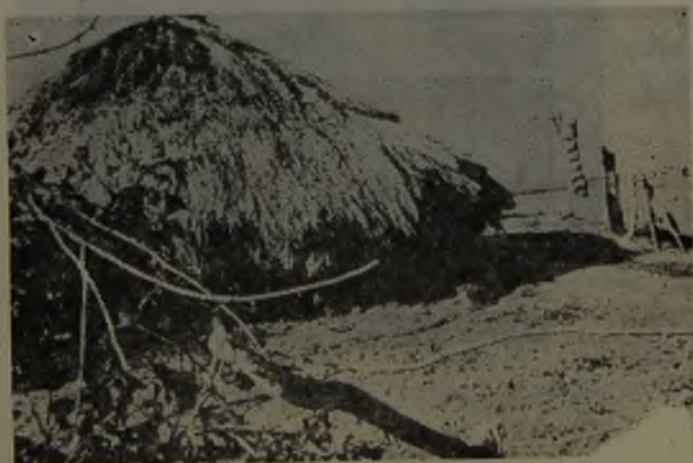
Figure 2. The home of a machi. This residence is on the reducción of Carrariñe, near Cholchol. Her rewe, set at an angle, is in her front yard.