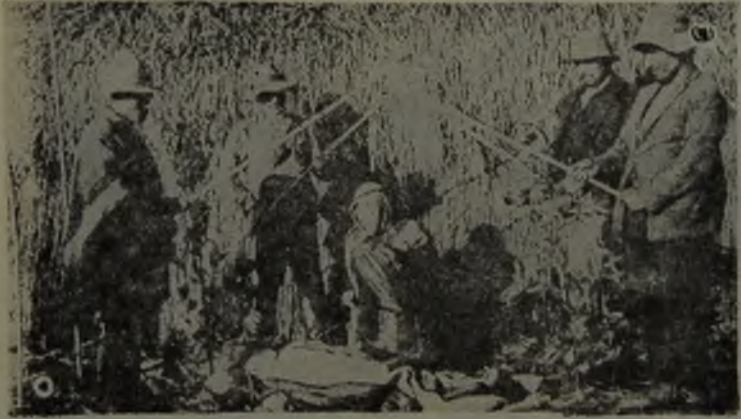
Figure 6. Part of a machitun (curing rite). At a signal from the machi in charge, a number of men are supposed to clash sticks, and to shout, "Ya, ya, YAI!" The noise is supposed to drive evil spirits away from the patient.