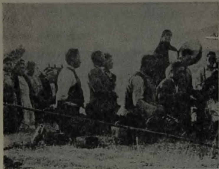
Figure 7. A machi in the ñillatun at Coigue. The machi stands with her kul-trun poised as the congregation kneels at the start of a ñillatun. The pipe in the foreground is part of a trutruka, an Araucanian wind instrument with which occasional blasts are sounded.