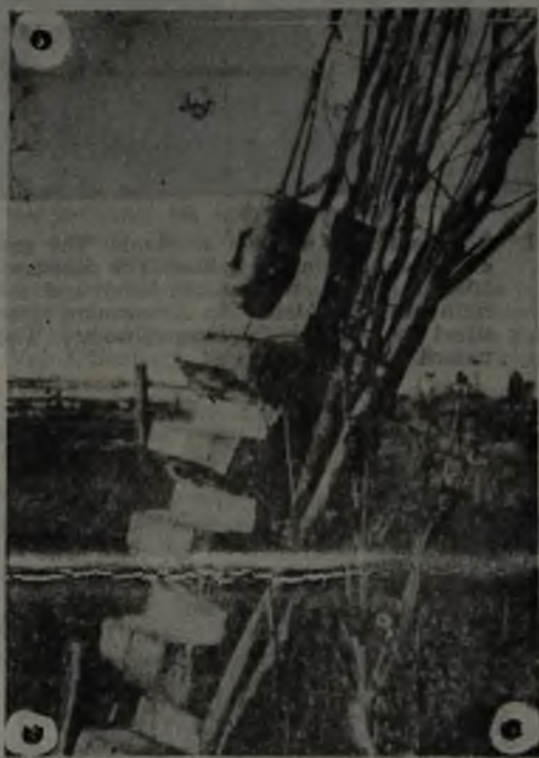
Figure 3. Another kind of rewe. This rewe has a carved above the last step.