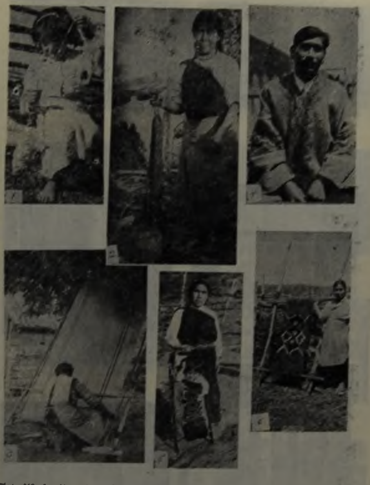
Plate Nº. 1 - Ver pégine 298

the second second second second second second second second second second second second second second second s